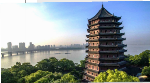
view of Hangzhou, China

I have been asked if I was interested in such a position in Hangzhou. Without hesitation I turned down the offer. My life here in Germany is comfortable enough that neither a high salary nor living in China is of much interest for me.