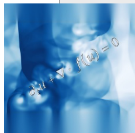
logo of the priority program

In Germany we will have a DFG funded emphasis program on hyperbolic equations, see here . This allows scientists working at a German university to apply for scientific projects. If funded, this would typically pay for a PhD student to work on this project. In addition all groups that are funded will meet regularly. The proposals are due in January 2023. If funded, the project will begin in the fall of 2023.